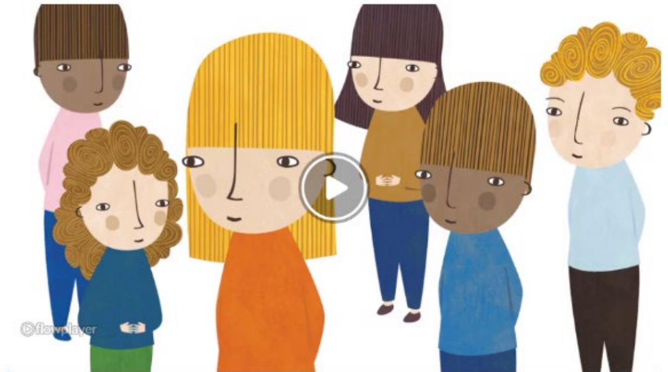
Video: Identifying signs of abuse